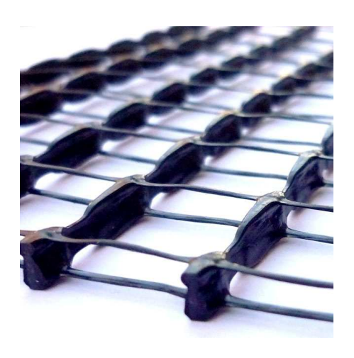
Geonet Core Drainage "Box-net"